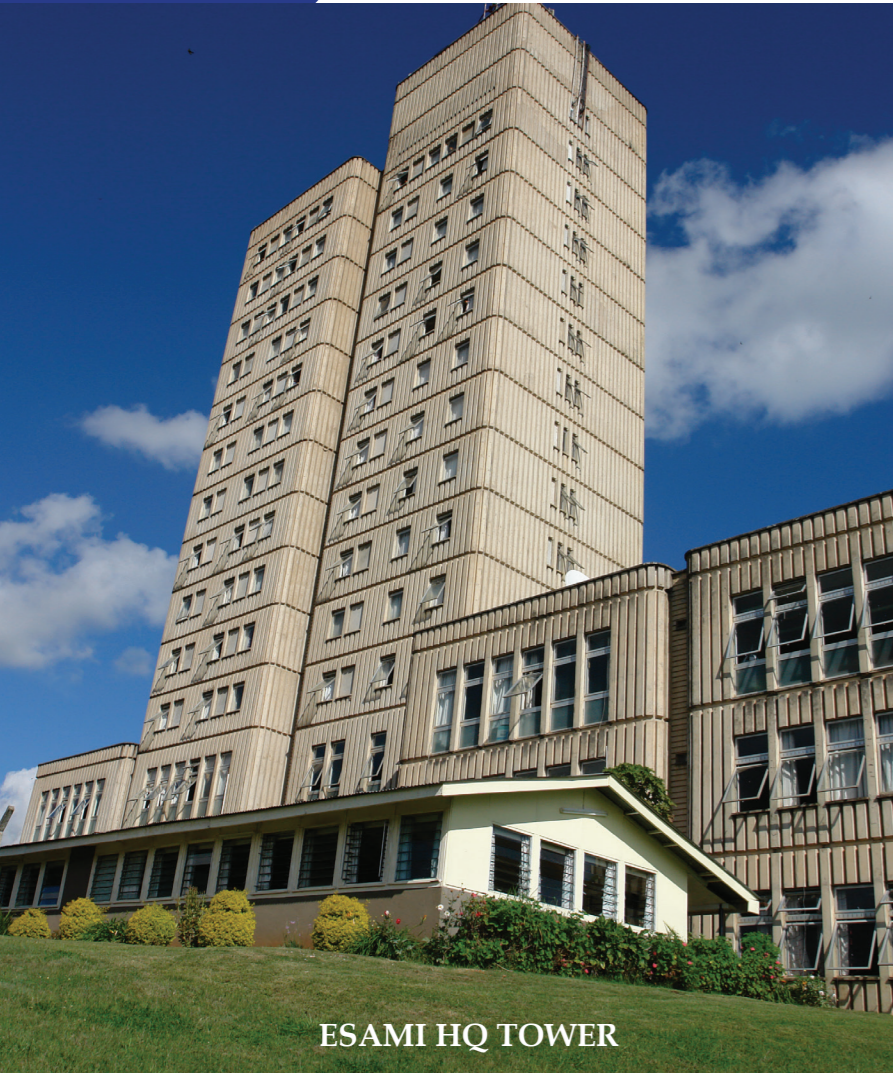
ESAMI HQ TOWER