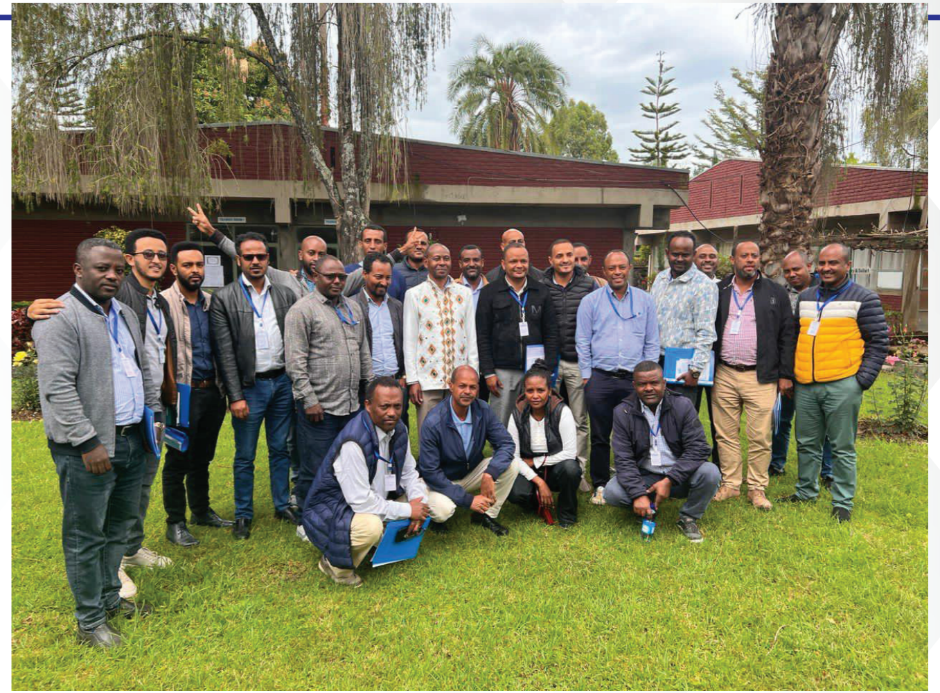
ETHIOPIA ROADS ADMINISTRATION PROJECT MANAGEMENT PROGRAMME PARTICIPANTS