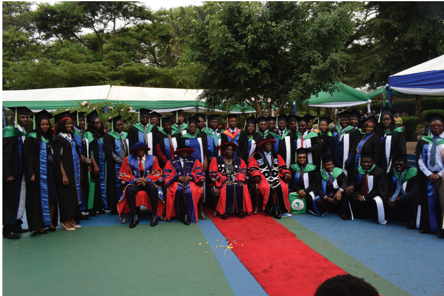
ESAMI GRADUATION PHOTO