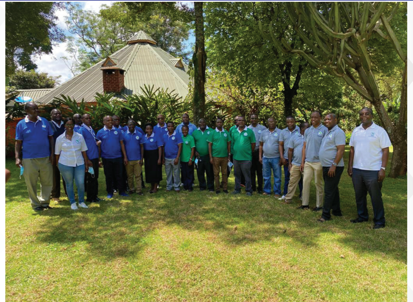
ESAMI PROFESSIONAL STAFF RETREAT