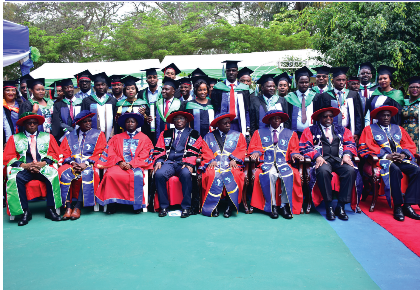
ESAMI GRADUATION PHOTO